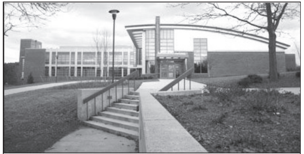
The Technology Center at the Haverhill campus of Northern Essex Community College.

Diversified Business Solutions (DBS), a Haverhill based printing company with 68 employees, has proven that innovation, environmental stewardship, and good business can simultaneously exist. The result is a successful, international-quality printing company, widely recognized for its efforts to reduce environmental impacts and minimize waste.